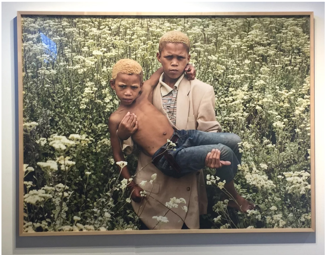
Pieter Hugo, Yossi Milo Gallery.