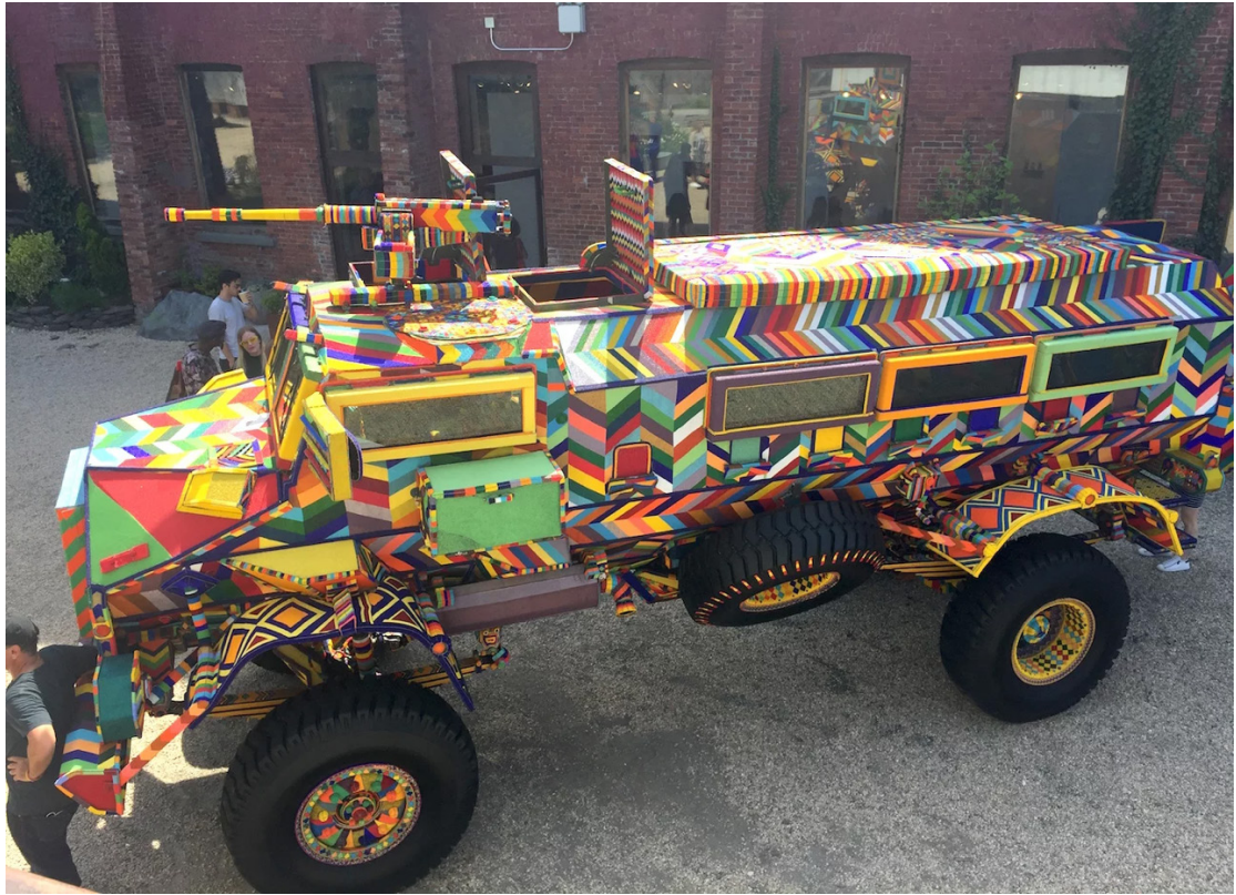
1-54 Special Projects Ralph Ziman.