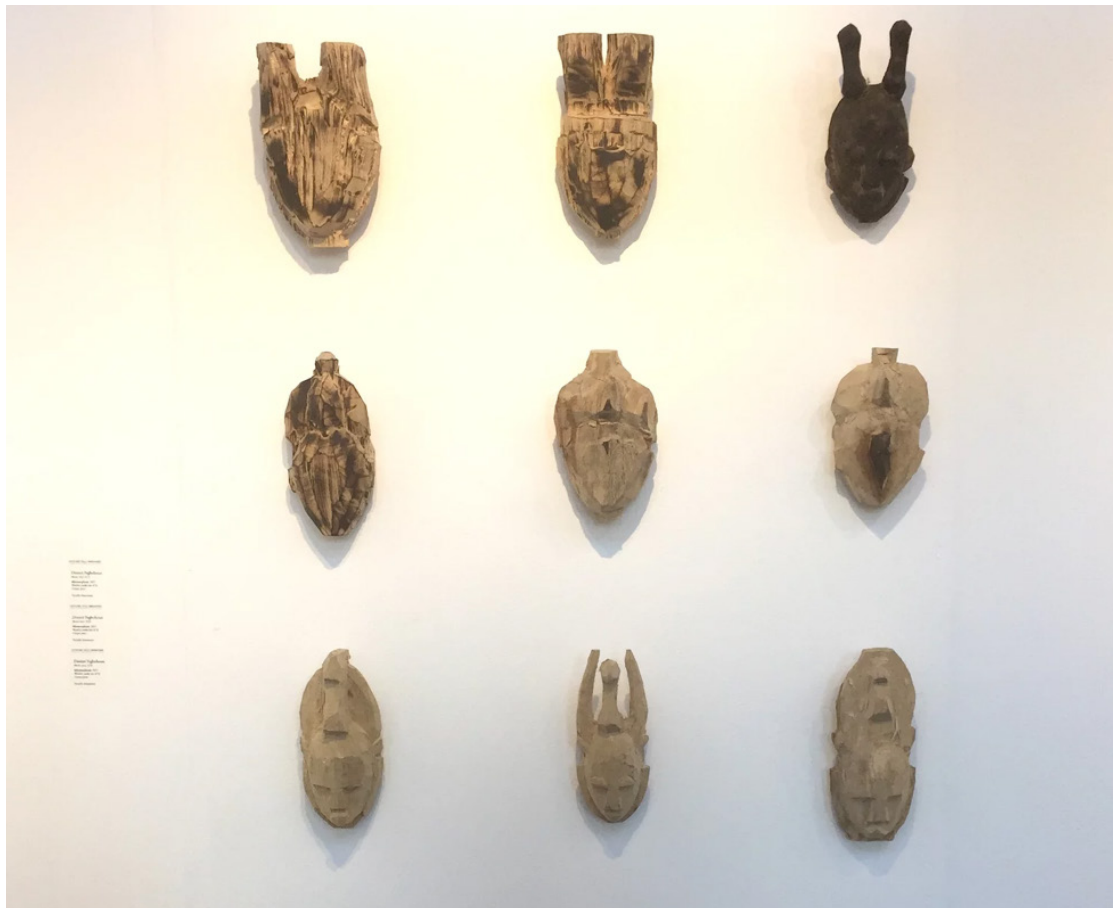
Dimitri Fagbohoun, Officine dell'Immagine. Photo: Ann Mbuti