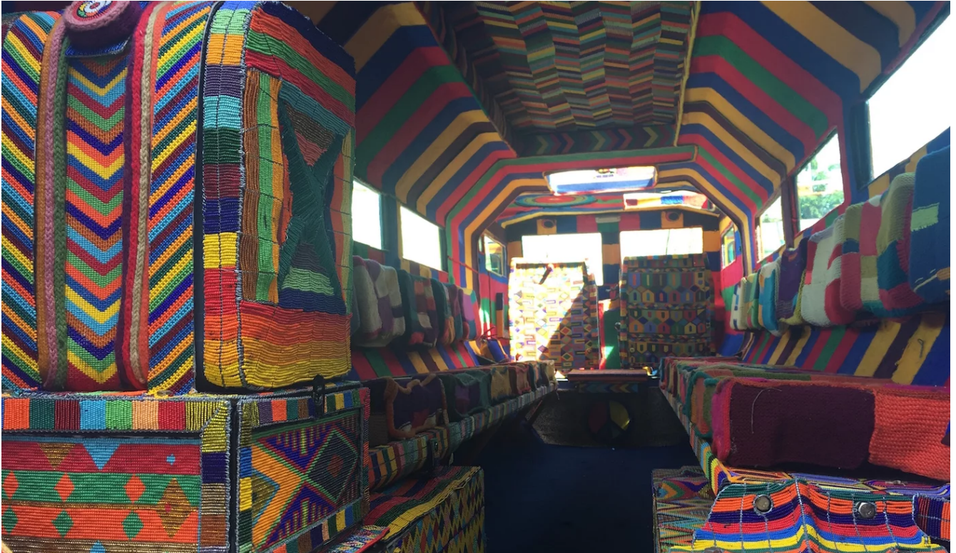
1-54 Special Projects Ralph Ziman.

1-54 New York returns for its fourth edition at Pioneer Works, Brooklyn between the 4 – 6 May 2018. With 21 participating galleries, 7 special projects and an extensive public program, the fair will live up to its claim to create space for dialogue and exchange.