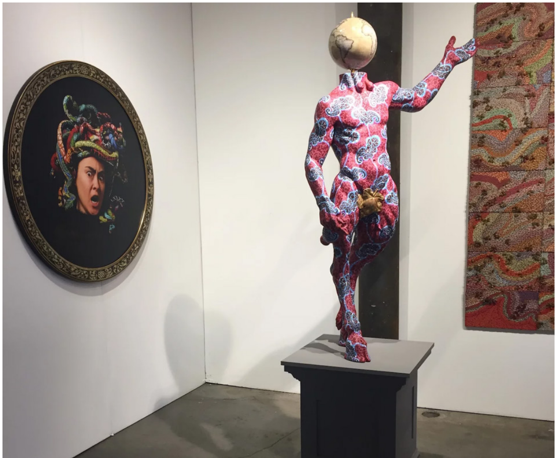
Yinka Shonibare MBE, James Cohan Gallery.